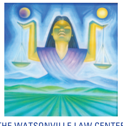
THE WATSONVILLE LAW CENTER